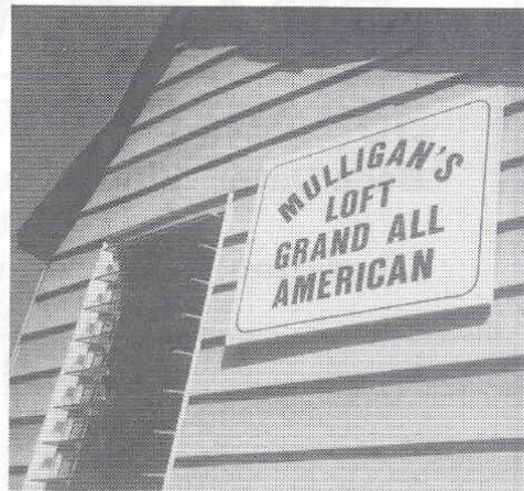
Advertising the pigeon sport to the neighborhood.

Brown's feed is a good quality commercial feed and is fed to all the birds year around. The birds are vaccinated for PMV and POX. Treatment for canker, coccidiosis, worms and respiratory as needed. A variety of those products are used so the birds don't build a immunity to any one product. The loft doesn't have first hand expe-