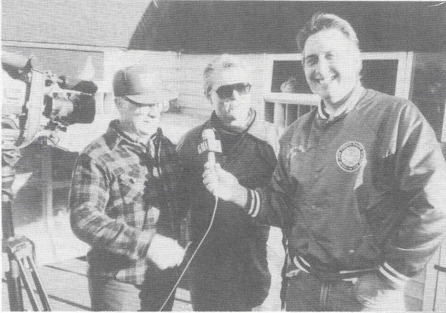
Mulligan's Loft being interviewed by Good Morning America

approximately 45 minutes to 1 hour. Then about 3 weeks before the first race they start training at 10 miles., 8 to 10 times. This increases to 20 miles 8 to 10 times, 30 miles the same. At 30 miles they get a morning toss and a 10 mile evening toss. They start the first week of racing with about 80 pigeons.